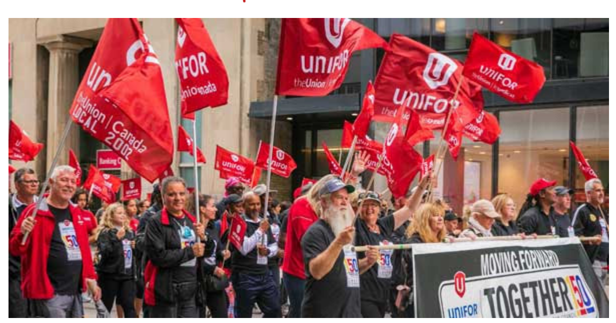
Unifor celebrated worker empowerment as members across the country gathered to mark Labour Day.