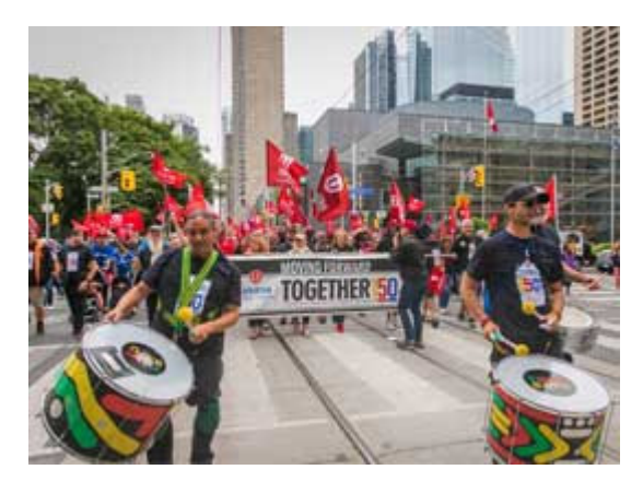
Unifor members marched in solidarity with thousands of union members and activists at the Toronto & York Region District Labour Council Labour Day parade.